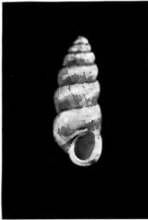
FIG. 10. Malarinia hova , new gen. and sp. CNHM No. 106701, front view; about \times 5 .

Remarks .—The affinities of this new form in the super-family of Cyclophoracea are still obscure; despite some similarities with the Cochlostominae, a close relation with the Diplommatinae seems more probable.